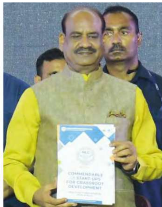
Shri. Om Birla unveiled the compendium on commendable start-ups for grassroots development

These four Compendiums on Commendable Democratic & Governance Initiatives were prepared by the NLC Research Team and released by Hon'ble dignitaries during this historic conference. It was presented to the legislators as one of their important takeaways from the Conference.