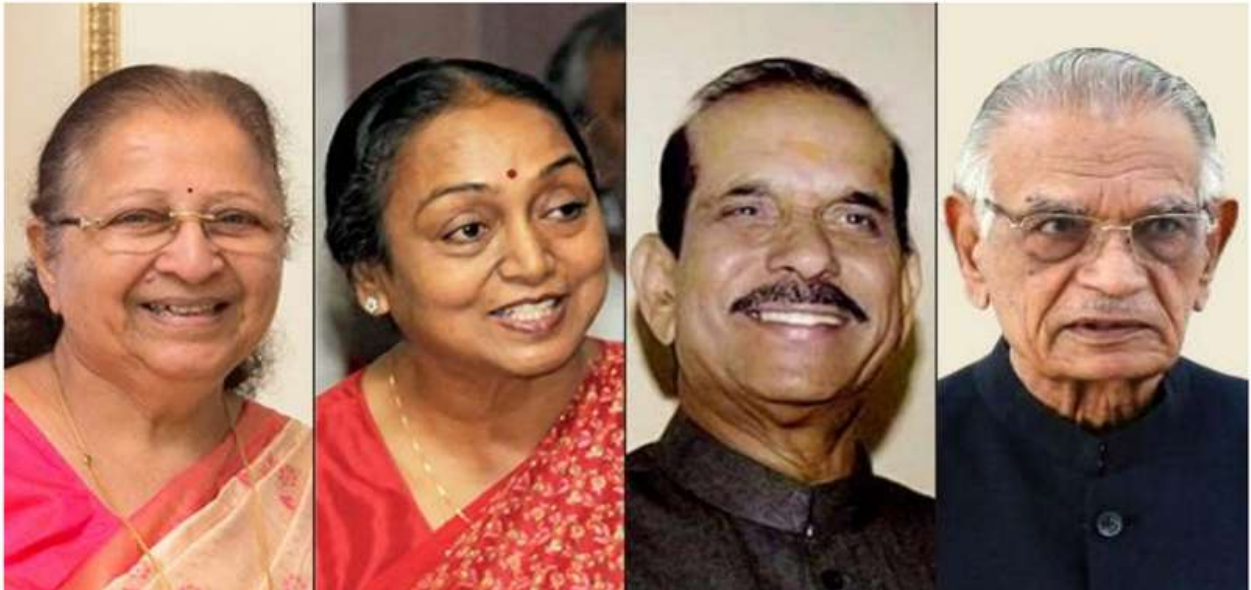
Smt. Sumitra Mahajan Former Speaker Lok Sabha