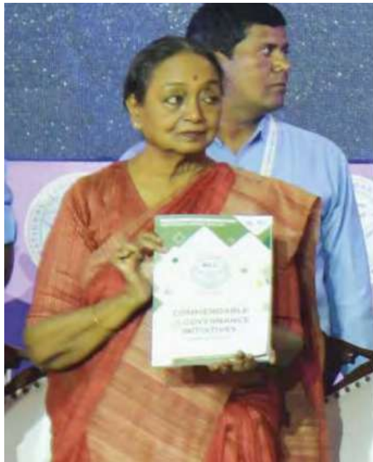
Patron Dr. Meira Kumar unveiled the compendium on Commendable Governance Initiatives