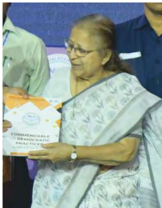
Patron Smt. Sumitra Mahajan unveiled the compendium on commendable democratic practices from other democratic countries