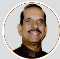
Late Dr. Manohar Joshi Former Speaker, Lok Sabha