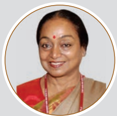
Dr. Meira Kumar Former Speaker, Lok Sabha