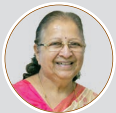
Smt. Sumitra Mahajan Former Speaker, Lok Sabha