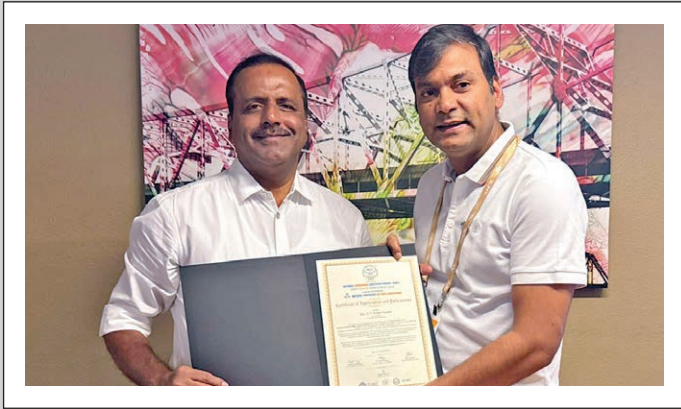
Shri. U. T. Khader