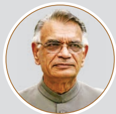
Shri. Shivraj Patil Former Speaker, Lok Sabha