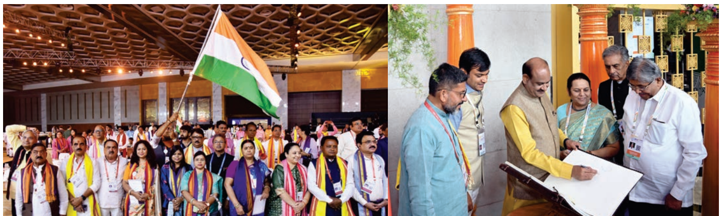
Glimpses of NLC Bharat - 2023 in Mumbai